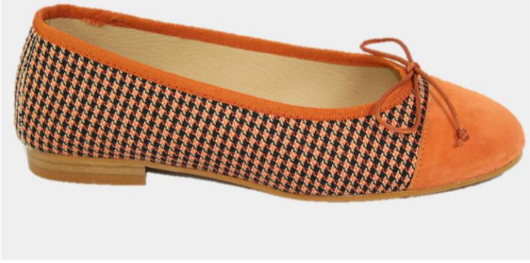
LEONA SUEDE MANDARINA