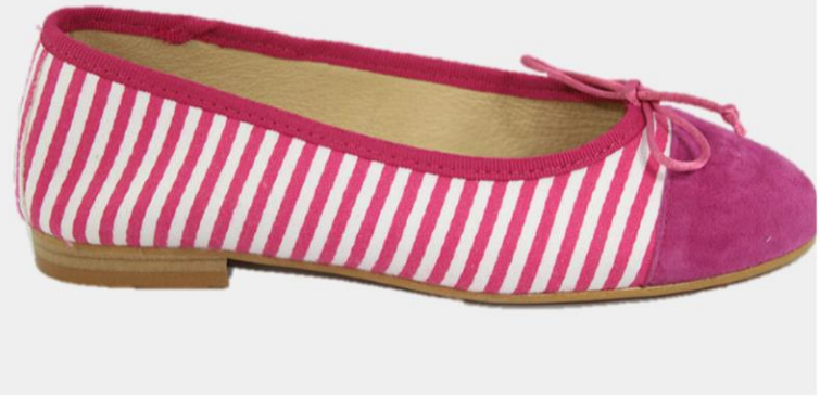
LEONA SUEDE STRIPE