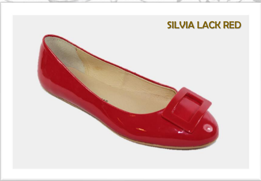
SILVIA LACK RED