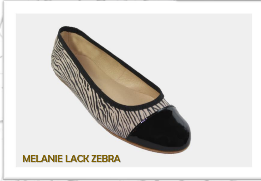
MELANIE LACK ZEBRA